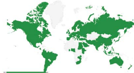
Figure 3 The Space Generation Advisory Council has 4000 members in 90 countries, with official points of contact in each member country

Active in space outreach and policy shaping