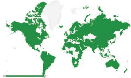
Figure 2 The Planetary Society has volunteers around the world who share key TPS messages with their local communities